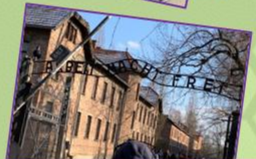
Lessons from Auschwitz Project