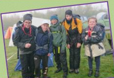
Ten Tors Jubilee Challenge