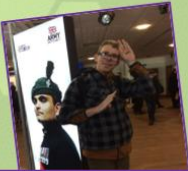
National Apprenticeship Show

There are many additional opportunities for students to take advantage of that enhance and enrich their programme in the Sixth Form and further their independence and experience. More detailed information about the activities below can be found on the school website