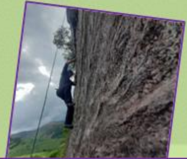
Outward Bound Scholarship