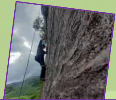
Outward Bound Scholarship