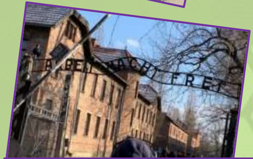
Lessons from Auschwitz Project