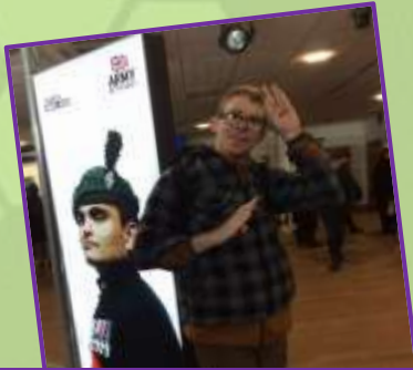
National Apprenticeship Show

There are many additional opportunities for students to take advantage of that enhance and enrich their programme in the Sixth Form and further their independence and experience. More detailed information about the activities below can be found on the school website.