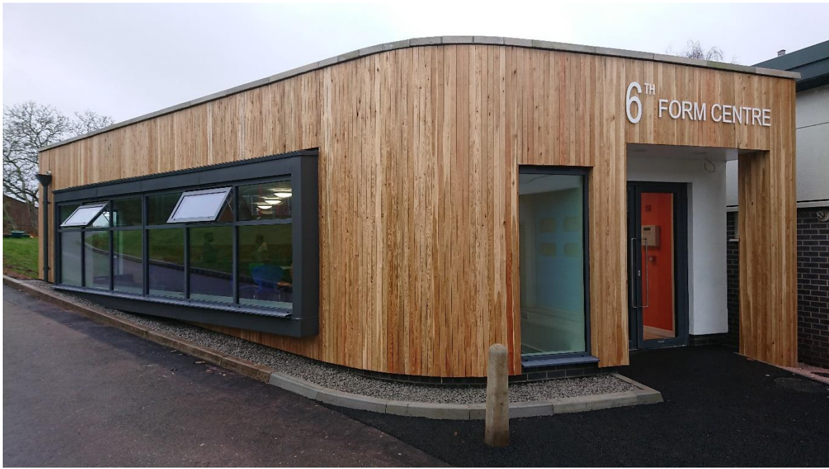
The new Sixth Form extension, which includes entrance way, new social area and office.