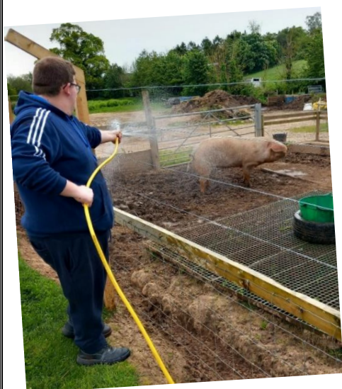
Pictured are students involved in various activities at Dawlish Gardens Trust.