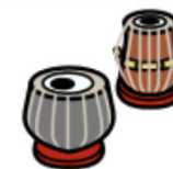
Tabla - a pair of small hand drums used in Indian music

Didgeridoo - an Australian Aboriginal wind instrument in the form of a long wooden tube, traditionally made from a hollow branch, which is blown to produce a deep sound