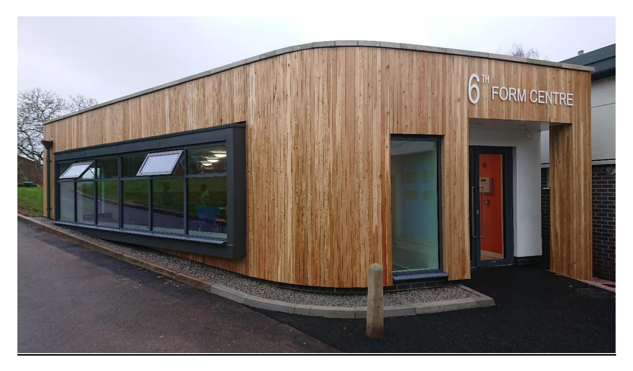
The new Sixth Form extension, which includes entrance way, new social area and office.